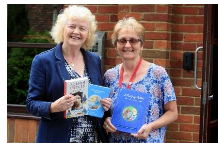
The Library was a great supporter