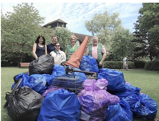
Top: Beaconsfield Now! 2017 Lower Left: Litter Pick haul!