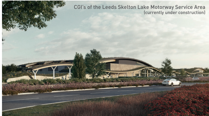
CGI's of the Leeds Skelton Lake Motorway Service Area (currently under construction)

Extra owns and operates two other MSAs in the wider Network Region, Cobham in Surrey (M25) and Beaconsfield in Buckinghamshire (M40, Junction 2). In Yorkshire, Extra are constructing a new MSA, Leeds Skelton Lake, at Junction 45 of the M1 which is scheduled to open in Summer 2019.